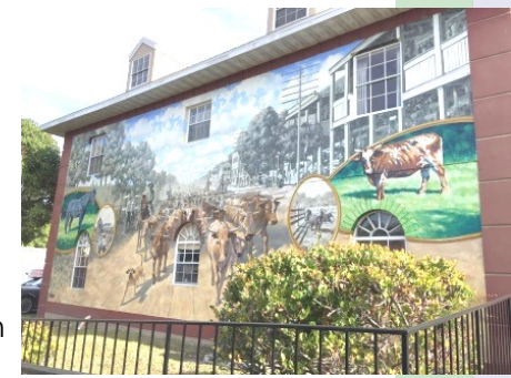
Cattle Drive Mural

hard-working residents of the South. Finally, Florida loves its alligators. They were restored too.