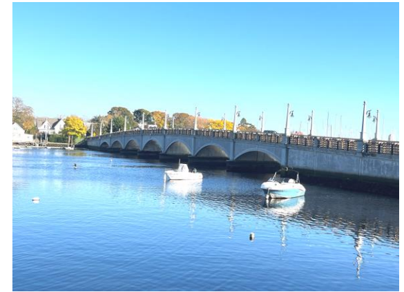
Bridge along East Bay Bike Path in Barrington

Both loops are mostly flat and on paved surfaces for an AVA rating of 1A. Trail would be doable for strollers, but might be difficult for wheelchairs due to uneven pavement in places.