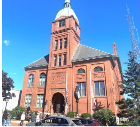
Warren Town Hall

BRIEF HISTORY: The town of Warren was first settled by the Pokanoket Indians. In 1632 Europeans established a trading post in the area with a permanent settlement following in 1653. During the mid-18th century, Warren was recognized as a leading whaling port and ship building center. When that industry declined, Warren became known for its textile manufacturing in the mid-19th century.