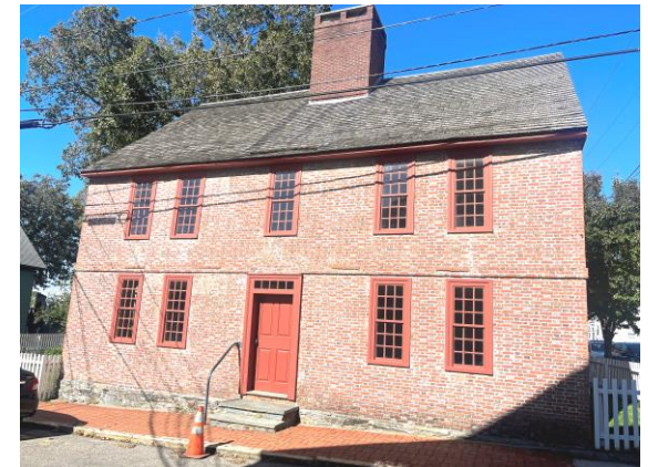
Oldest Brick House

More information on walk events and Walk 'n Mass Volkssport Club at: