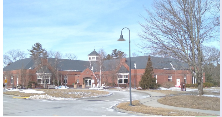
Weston Public Library