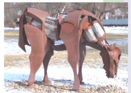
Sculpture by Jamie Burnes