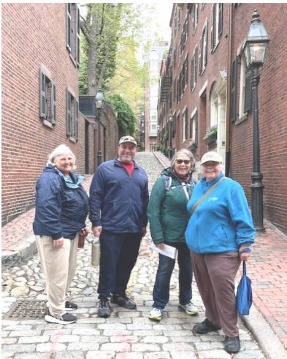
On April 27, the Back Bay group walkers posed for a photo at the foot of Acorn Street, "the most photographed street in Boston."