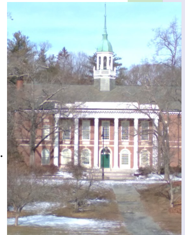
Weston Town Hall

Both routes are mostly flat and on paved surfaces, giving them an AVA rating of 1A. The trails are doable for strollers, but difficult for wheelchairs due to the wooded trails and uneven pavement in some places. Hope for good weather and join Walk 'n Mass for 5km and 10km walks through the pretty town of Weston on Saturday, June 7. See you on the trail.