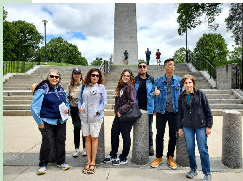
Left: Boston Freedom Trail group on June 1