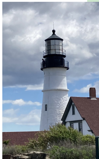
Lighthouse Weekend

Again, thanks to everyone who made this event a success. See you at the next Northeast Region weekend!