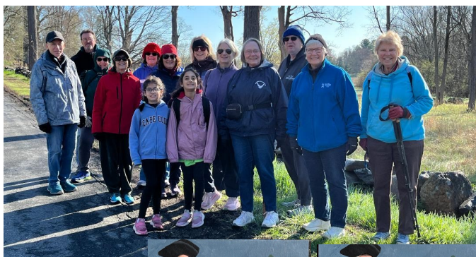
Concord on April 20 for Patriots' Day parade and fun