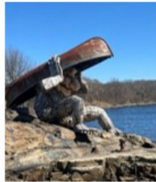
Dambo Troll on East Bay Bike Path East Providence, RI Mrs. Skipper