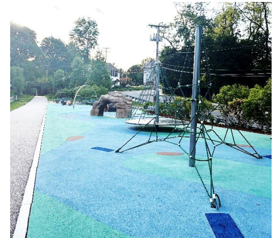
Playground at Roosevelt Park

AREA HISTORY: This region was first inhabited by the Nipmuc. Blackstone was settled by European immigrants in 1662 and was incorporated in 1845. The town was originally part of Mendon, Massachusetts before becoming a separate municipality. Blackstone is within the area of the John H. Chaffee Blackstone River Valley National Heritage Corridor of Massachusetts and Rhode Island.